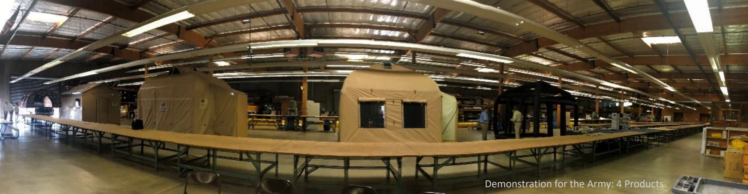
Demonstration for the Army: 4 Products

The world has evolved, there's now an increased awareness of disasters.