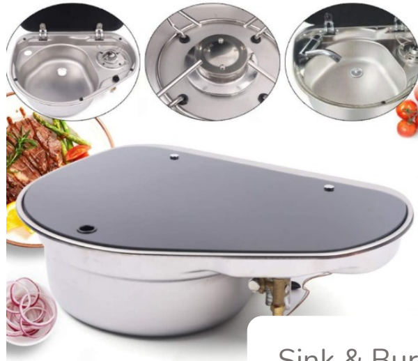
Sink & Burner