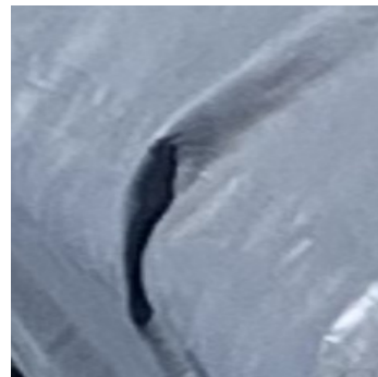
Optional Wood-grain Flooring, Accessory Pillows. Standard Waterproof Exterior Fabric