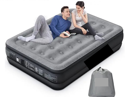
Inflate in 2 Minutes