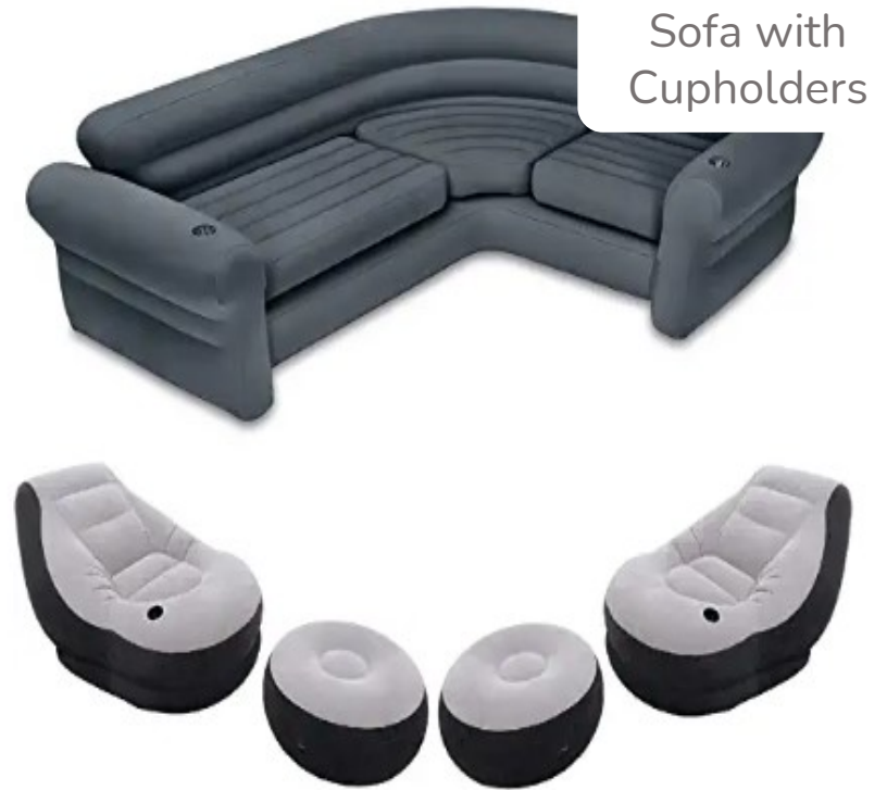
Sofa with Cupholders