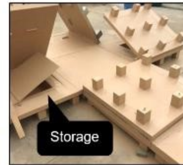
Into a Floor

Unique to Life Cube: The Shipping Container Transforms Into The Floor Keeping You Out of the Mud and Away from the Critters