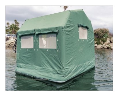
Buoyant, tether to dock