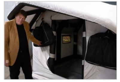
Seen here with Environmental Control Canopy