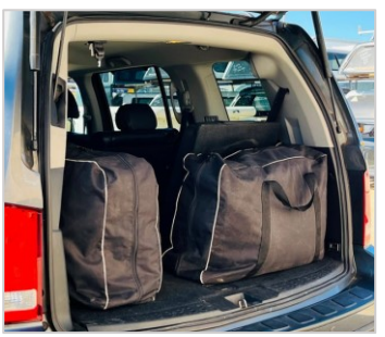
Fits in 2 duffle bags 10-minute deployment